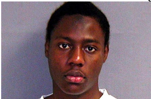
Umar Farouk Abdulmutallab